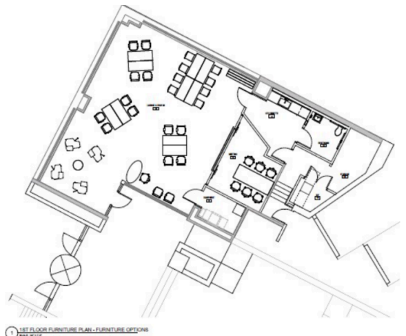
1st Floor Furniture Plan - Furniture Options